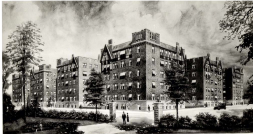
Artistic rendering of the Allerton Coops, c. 1926.

of directors, elected by the tenants, decided which new applicants got the vacant apartments.