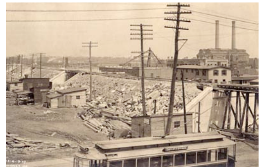
For many years, Port Morris has been an industrialized community in the South Bronx. This 1907 photograph shows a trolley traveling to the heart of the district via East 138 th Street.

Randall's Island, on the other hand, was acquired by New York City and became the anchor of the Triborough Bridge (now known as the Robert F. Kennedy Bridge) in the 1930s. Robert Moses developed it into a major park and recreation facility with the walkway of the bridge providing pedestrian access to it from The Bronx. Now a pedestrian bridge connecting Willow Avenue in Port Morris to the northeast corner of Randall's Island will provide a more direct access to this major park for mainland residents.