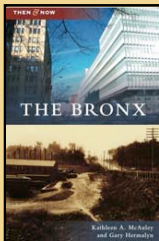
The Bronx: Then & Now $21.99