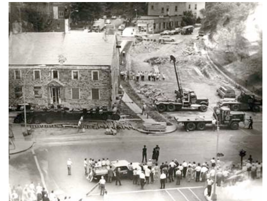
The historic Valentine-Varian House being moved from one side of Bainbridge Avenue to the other in 1965. The Society took over the house as its first permanent location. Today, the house is open as the Museum of Bronx History.