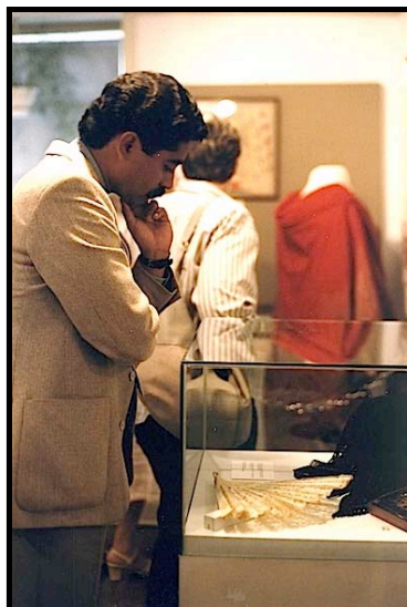
A gentleman studies an artifact from the Ferris Family Collection at the Museum of Bronx History.

The Ferris Family of Westchester Town dates back to the 17 th century, when the area was still hotly disputed by the Dutch and English. As the town became the county seat for Westchester County, the Ferris name has graced the