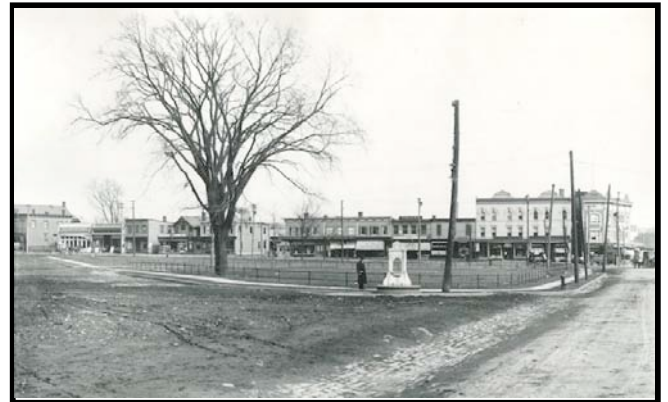
Westchester Square in the southeast Bronx still held remnants of its rural past in 1910. The Ferris Family legacy dates back in this area to colonial times.

A large portion of the extensive archive at The Bronx County Historical Society consists of items donated from private collections of Bronx families. These collections have been compiled by generations of Bronxites who have lived in a certain area of The Bronx for many years. Interestingly, a thorough study of these donated collections quickly reveals a historic tale of a neighborhood or place. Whether it be a series of photographs, letters, books, clothing, household items, or other objects, one's family collection can offer a plethora of historical facts about a neighborhood that may not be available anywhere else. With every large family collection accessioned into the collections of The Society, an extensive narrative about an important area can emerge. Such was the story of the Ferris Family collection donated to The Society many years ago.