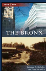
The Bronx: Then & Now $21.99