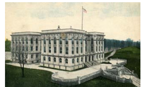
The old Bronx Borough Hall was a reminder of an era when The Bronx was still a part of New York County. However, it was in this edifice that the new Bronx County was first headquartered.