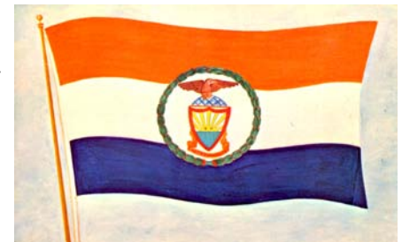
The Bronx borough flag was designed in 1912. It derived from the Netherlands tricolor of 1639 - the year Jonas Bronck arrived in what is now The Bronx. The Bronck shield, with the borough's motto, NE CEDE MALIS (yield not to evil), appears in the center.

After a major fire destroyed the county courthouse in 1758, the county seat was moved from the town of Westchester to the town of White Plains. It was not until a series of city governmental changes that led to the major annexations of The Bronx to New York City in 1874 and 1895, that the process of recognizing The Bronx as its own individual county began. After major efforts to gain county status, The Bronx finally became one on January 1, 1914 with a swearing-in ceremony of the new county elected and appointed officials at the old Bronx borough courthouse on East 161 st Street and Third Avenue. Bronx County became the 62 nd and last county of the state of New York and we celebrate 2014 as the centennial year when the county seat returned after so many years.