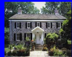
Valentine-Varian House/Museum of Bronx History 3266 Bainbridge Avenue & East 208 th Street

Owned by The Bronx County Historical Society, the house is a member of the Historic House Trust.