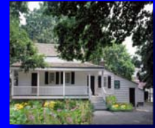
Edgar Allan Poe Cottage Poe Park Grand Concourse & East Kingsbridge Road

To make a donation to this wonderful event, contact The Society (718) 881-8900 or donate online at http://www.bronxhistoricalsociety.org/valedictorian