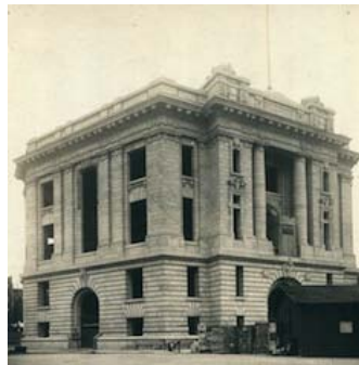
A 1908 photograph of the first Bronx County courthouse on Third Avenue and East 161 st Street.