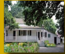
Edgar Allan Poe Cottage Poe Park Grand Concourse & East Kingsbridge Road