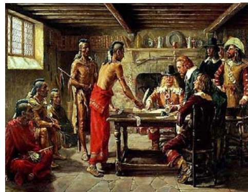
A 1908 painting done by John Ward Dunsmore depicts a treaty between the Weckquaesgeek natives and the Dutch at the home of Jonas Bronck in 1642.

Life in New Netherland was not easy. Living on the frontier and the work involved with clearing land for settlement was arduous. Relations between the Dutch and natives were tempestuous. However, there is no record of Bronck having any altercations with the natives. His own home was used as a site for a 1642 peace treaty signing (pictured above).