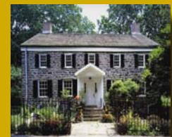
Valentine-Varian House/Museum of Bronx History 3266 Bainbridge Avenue & East 208 th Street

Owned by The Bronx County Historical Society, the house is a member of the Historic House Trust.