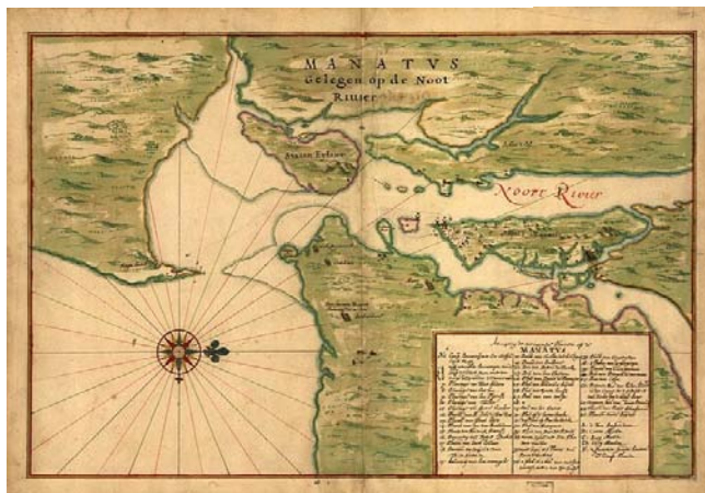
This 1639 map of New Netherland by Johannes Vingboom shows Bronck's farm on the southern tip of today's Bronx, located on the far right center.