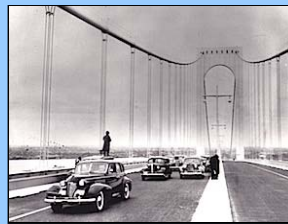
Bronx-Whitestone Bridge on opening day, April 29, 1939.

Exhibitions will run from October 22, 2014 through April 12, 2015