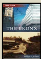
The Bronx: Then & Now $21.99