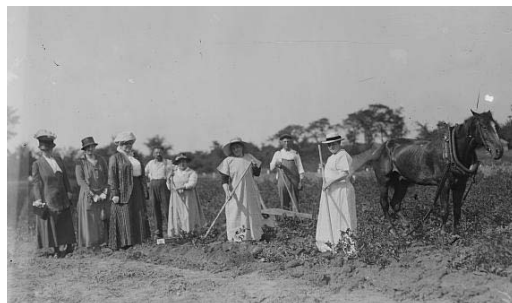
Suffrage Farm, 1917.