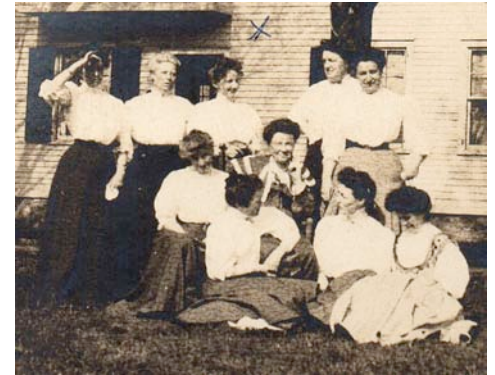
The Bronx Athenaeum Club, 1908.