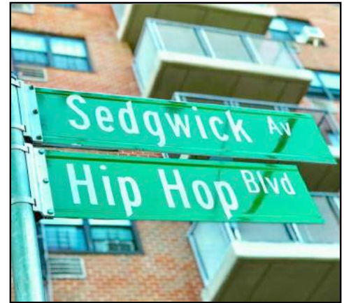
A co-naming street sign designating this portion of Sedgwick Avenue as “Hip Hop Boulevard” was installed in front of the 1520 Sedgwick Avenue residential high-rise on June 8, 2017.

Although Hip Hop is heard in all corners of the Earth, not too many know under what conditions The Bronx was when this popular music genre began. Young African-American and Puerto Rican men honed in on their musical and dancing talents to express what was affecting them in their communities at the time. When Hip Hop was born in The Bronx in the early 1970s, the city was undergoing austere measures due to fiscal problems, leading to the systematic downsizing of basic services such as garbage pick-up routes, police patrol shifts due to increased crime, loss of employment, rampant drug use due to the closing of rehabilitation centers, and more. The city’s fiscal crisis of the 1970s almost destroyed parts of The Bronx, leaving a long-lasting impression of President Jimmy Carter walking through Charlotte Street in 1977 as the image that made The Bronx a poster child for urban decay in America.